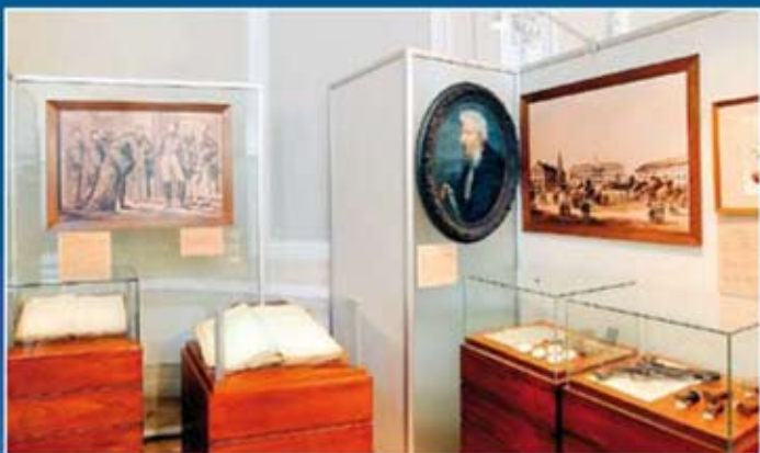
The Warsaw University Museum