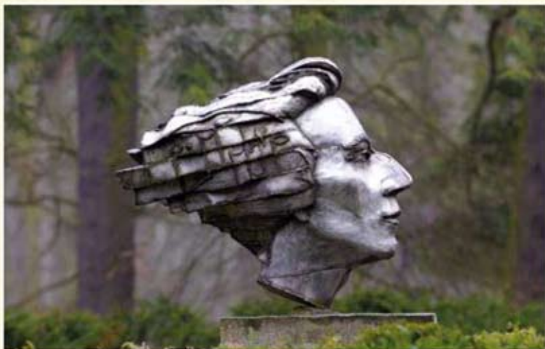
A sculpture of Chopin's head in Antonin park