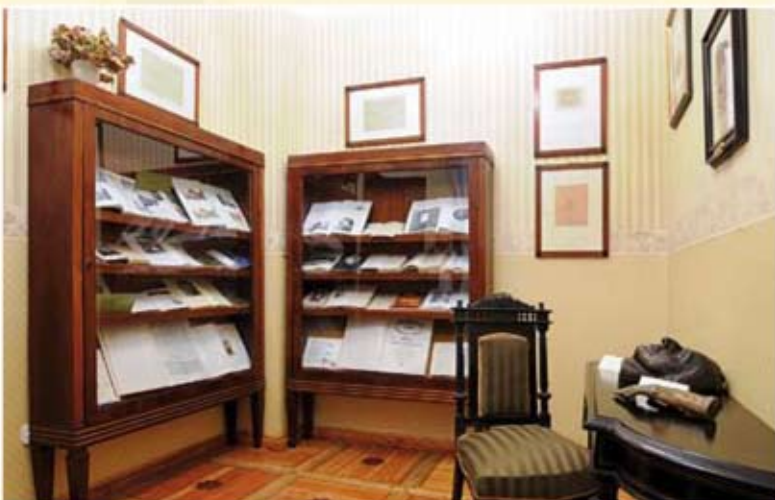
An exhibit at the Radziwiłł palace